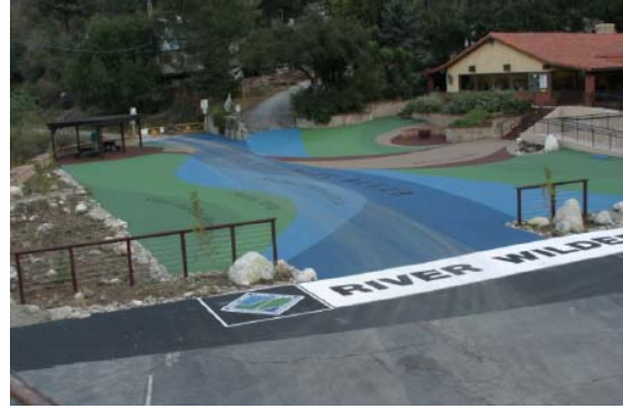
Figure 4. Finished Project.

The Watershed Coordinator continues to work with city staff and other stakeholders to identify additional opportunities to improve watershed conditions.