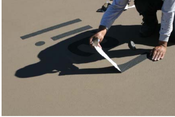
Figure 3. Revealing Graphics Hidden Under Paint.